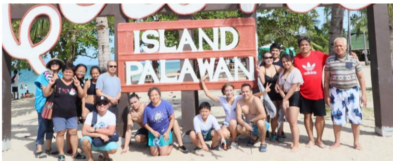
Pre-COVID family reunion in Palawan

If you did not have to worry about money or time, and were not working in the healthcare field, what would you be doing as a vocation? If I did not get married, I probably would have been a nun