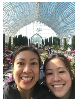
Exploring the Como Park Conservatory with my sister

If you did not have to worry about money or time, and were not working in the healthcare field, what would you be doing as a vocation? Teaching