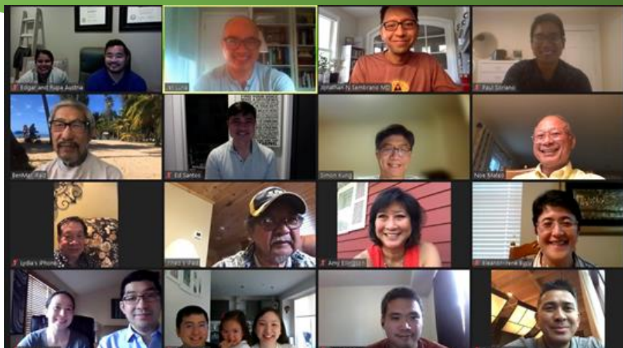
Snapshot of the 2021 PMMA Spring Meet and Greet