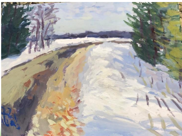
Reflection of Sunshine on the Lake. Watercolor. 2021

My life in the US was not extraordinary. I had my internship at Grace Hospital in Detroit and had my General Surgery Residency at William Beaumont Hospital in Royal Oak, Michigan. After finishing my training, I moved to Gaylord, Michigan with my family in 1973. I practiced medicine 30 years and retired in 2010.